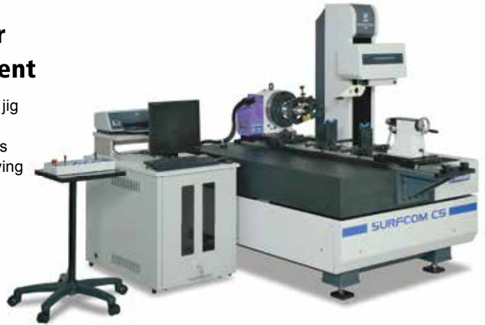
Example for crankshaft