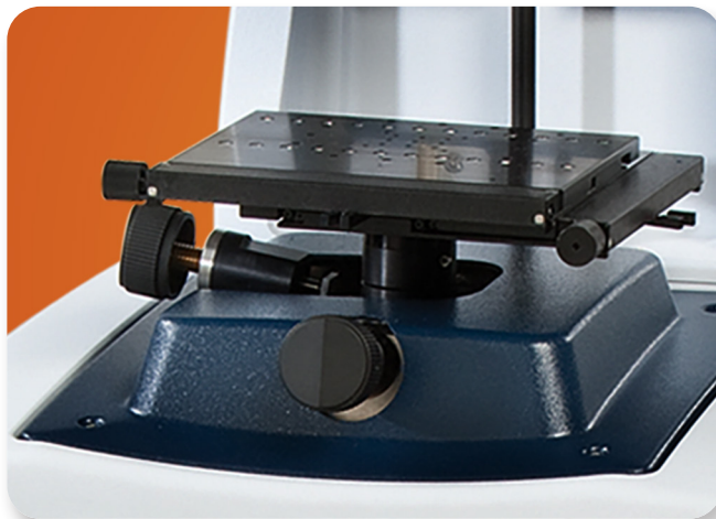
ContourX-100 manual stage.

WLI offers constant and ultimate vertical resolution for all objectives.